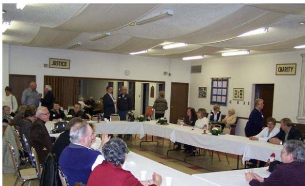
Networking at the Meet N Greet

A message from the chair explained the purpose of BRAED and past and current projects. He stated the importance of members bringing their ideas to the table. "Without ideas the organization isn't much" he stated.